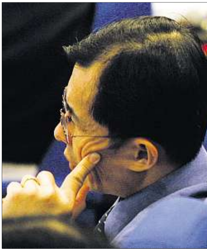
One of the participants listens carefully to the briefing on the Supplemental Contributory Pension during a roadshow for private sector held at the Ministry of Finance, Commonwealth Drive yesterday. Picture: BT/Saifulizam